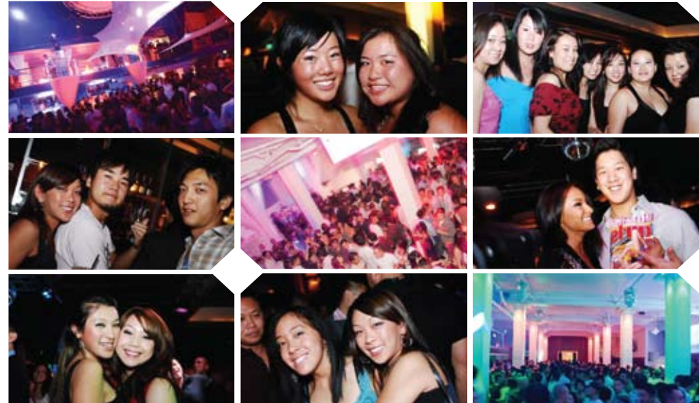
CLIMAX SF + SYNERGY (SAN FRANCISCO) Nightlife in general – San Francisco's nightlife scene is as diverse as "The City" itself. Depending on your vibe and the type of music you are interested in, there are many bars, clubs, and lounges that can fulfill your needs. If you're into hip-hop, SF's SOMA has plenty of clubs within walking distance. For bar hoppers and rockstars, the Mission District is the place to be. For more elegant and upscale bars and lounges, the Marina is the place to hang out. There are also a handful of gay-friendly bars located in the Castro . Last but not least, North Beach and Broadway are always open late for party-goers that do not want the night to end.