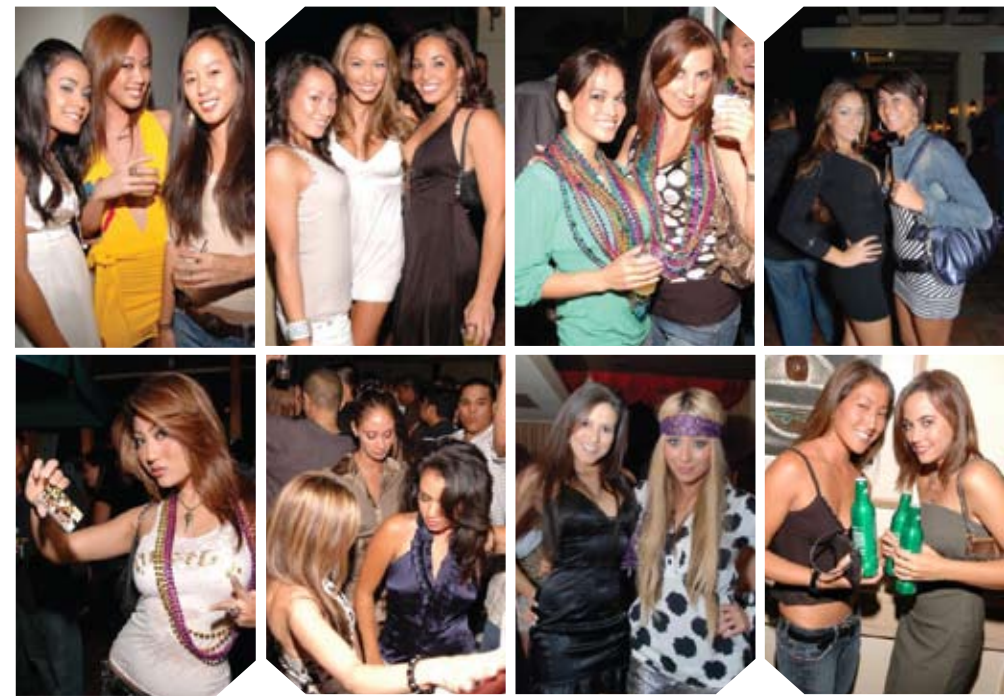
TANTRIQ ENTERTAINMENT (HAWAII) - Need something to do or a place to enjoy the night life in Hawaii? Well Tantriq Entertainment, Islandfire Productions, and Architech Hawaii gives locals and visitors something exciting to do at the "Playground." Such events are held W Honolulu and the Raw Bar.