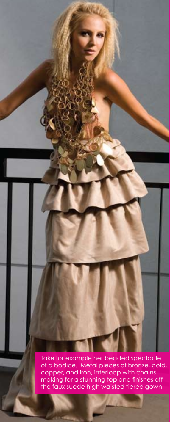
Take for example her beaded spectacle of a bodice. Metal pieces of bronze, gold, copper, and iron, interloop with chains making for a stunning top and finishes off the faux suede high waisted tiered gown.